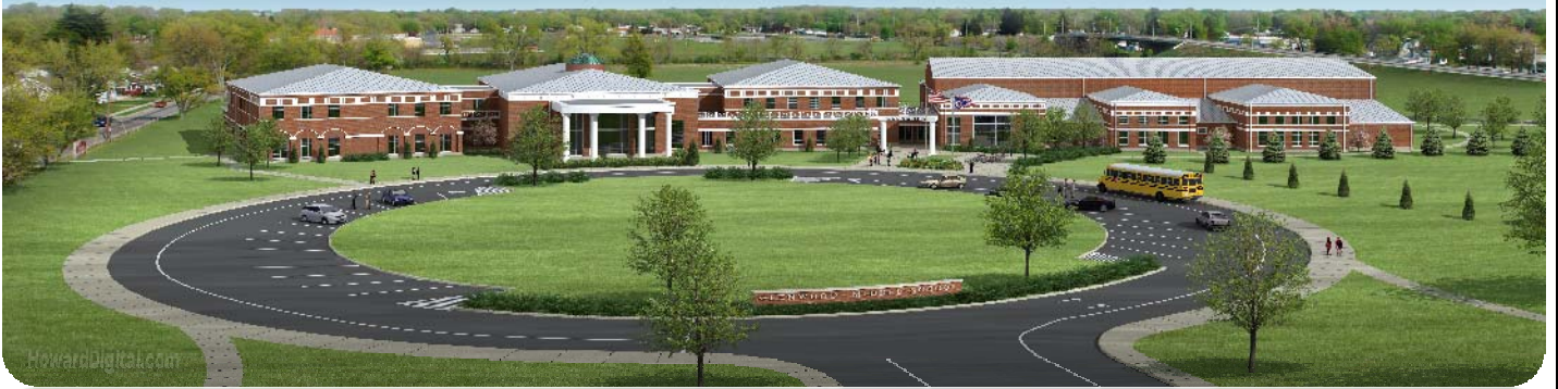
Rendering of Glenwood M.S.