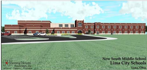
New South Middle School Lima City Schools Lima, Ohio